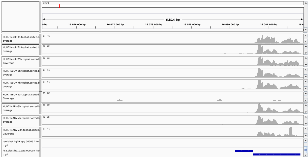
Figure 1: IGV Genome Browser screenshot of gene MYCNOS.

This gene is down-regulated in the Ebola infected cells in human after 23 h.