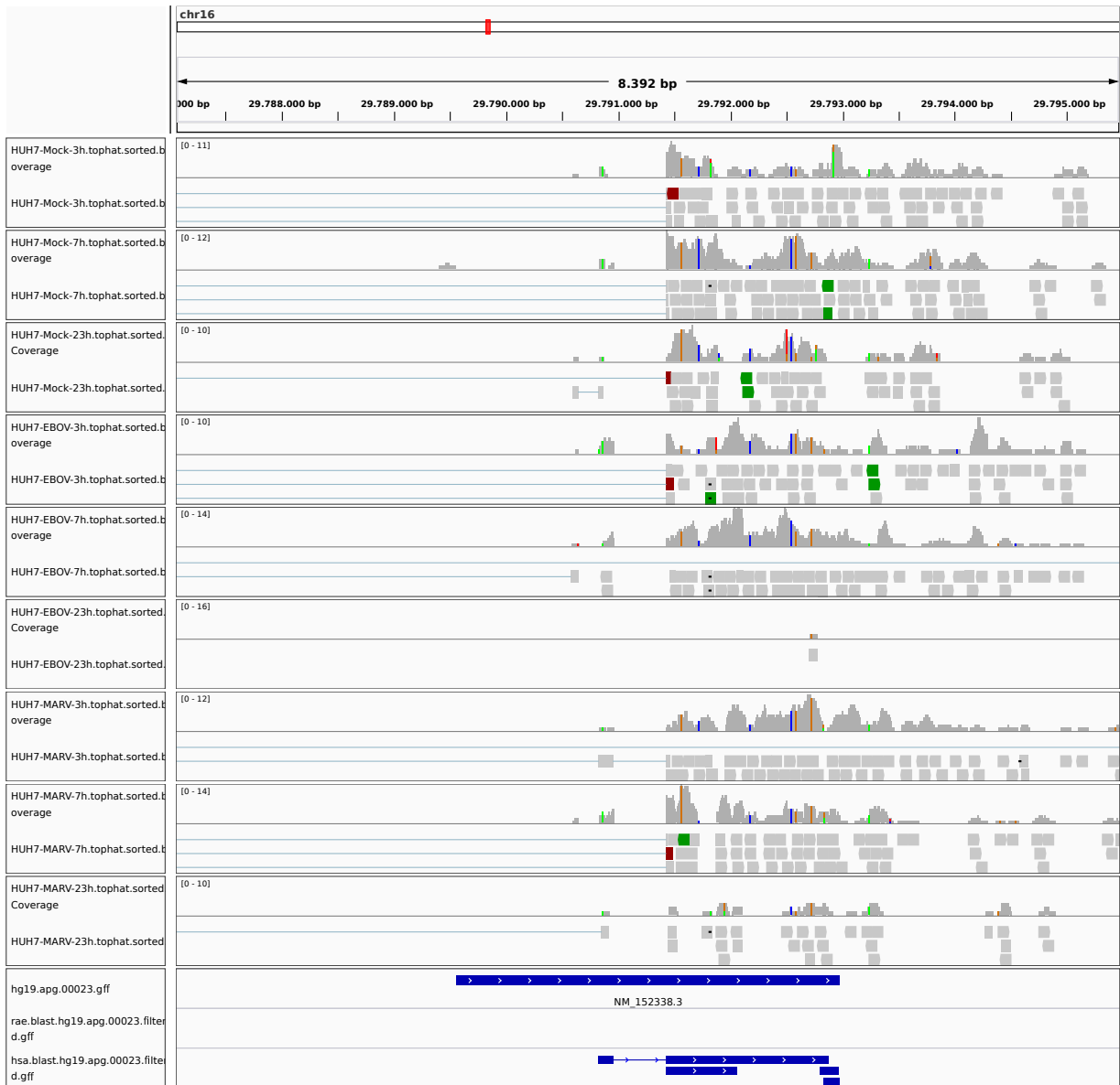
Figure 1: IGV Genome Browser screenshot of gene ZG16.