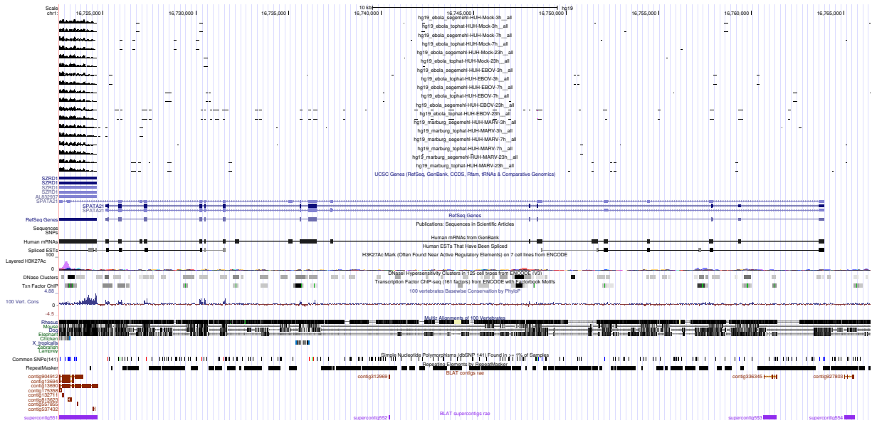
Figure 3: UCSC Genome Browser screenshot of gene SPATA21.