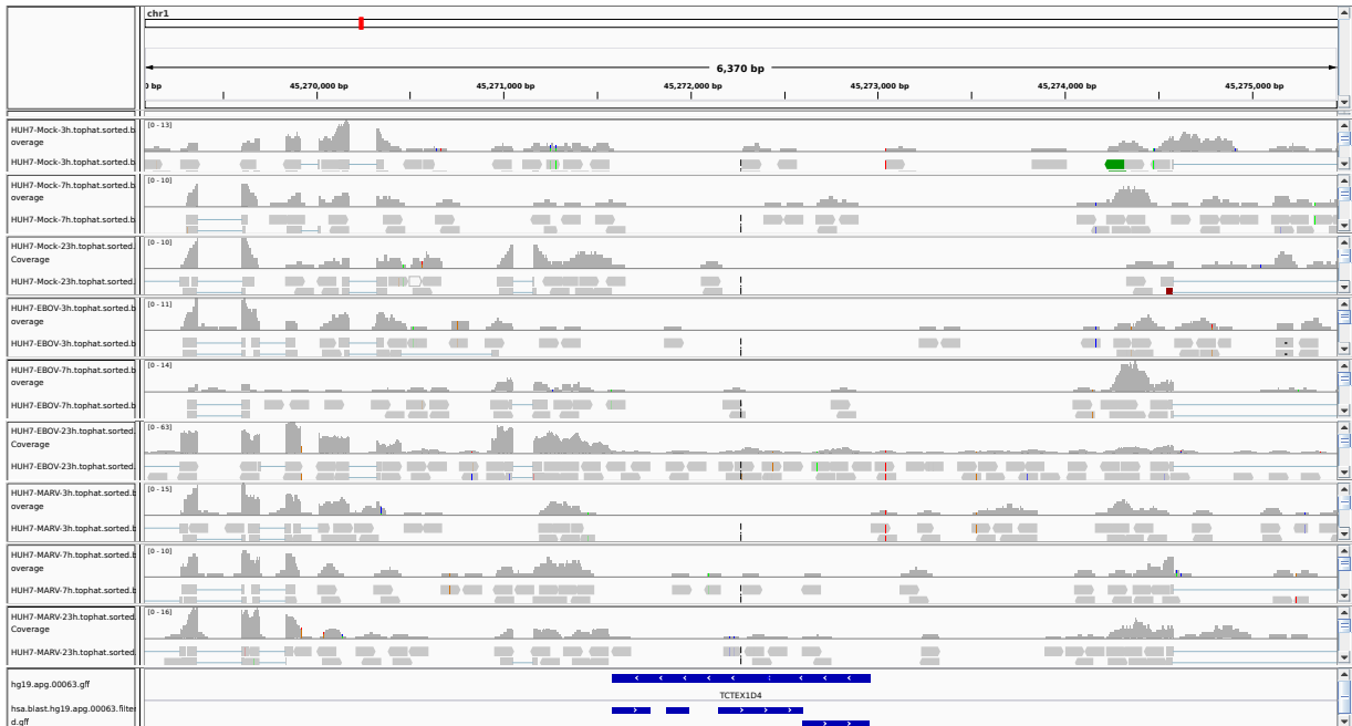
Figure 1: IGV Genome Browser screenshot of gene TCTEX1D4.

Homo sapiens Tctex1 domain containing 4 (TCTEX1D4), mRNA. No expression.