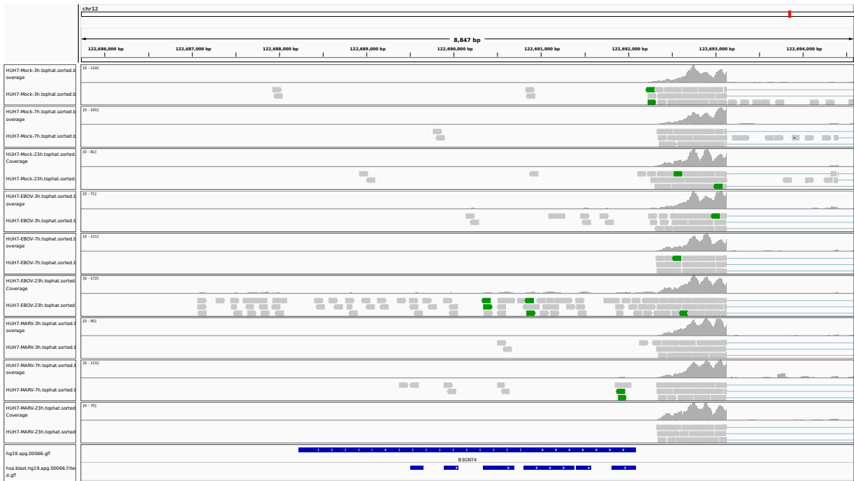
Figure 1: IGV Genome Browser screenshot of gene B3GNT4.

This gene is not expressed in any samples. The adjacent DIABLO-locus is highly expressed.