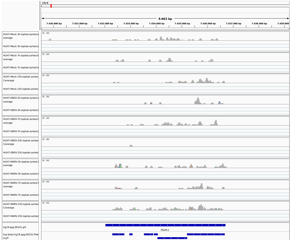
Figure 1: IGV Genome Browser screenshot of gene PSAPL1.

The PSAPL1 is not expressed in the investigated cell lines.