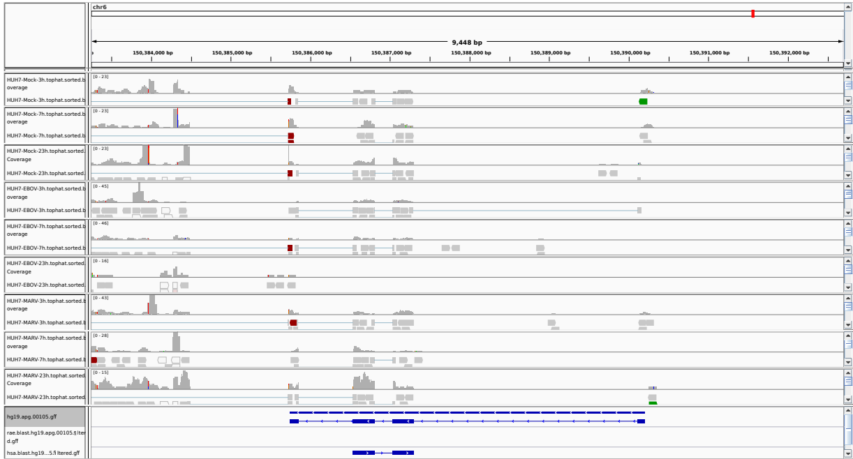
Figure 1: IGV Genome Browser screenshot of gene ULBP3.

Low expression and short gff annotation (compared to the UCSC annotation).