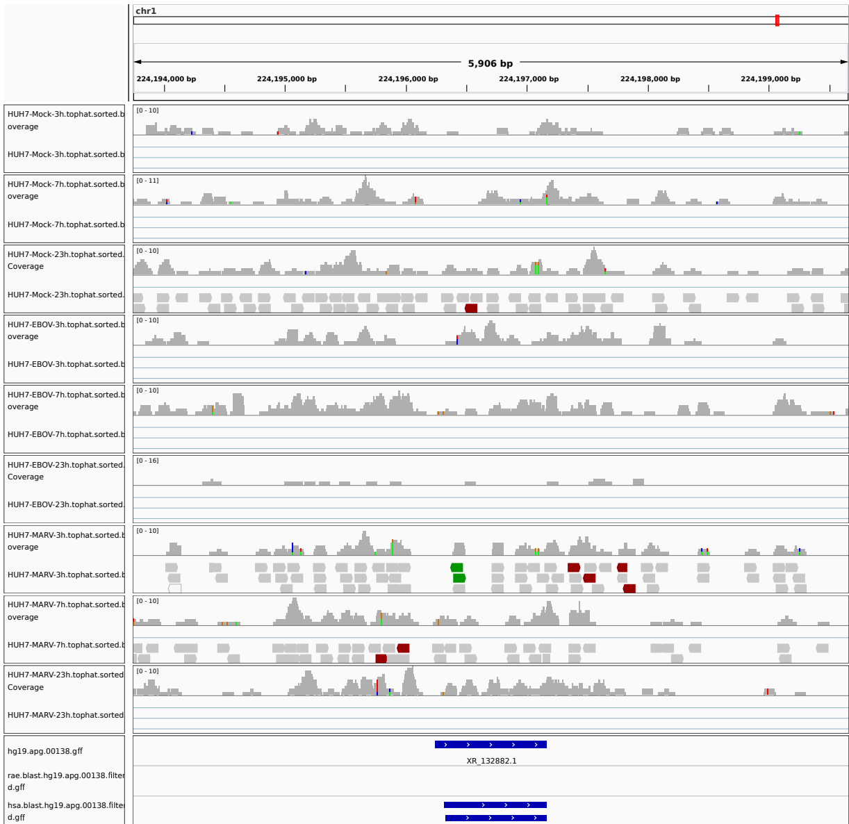
Figure 1: IGV Genome Browser screenshot of gene LOC100287497.