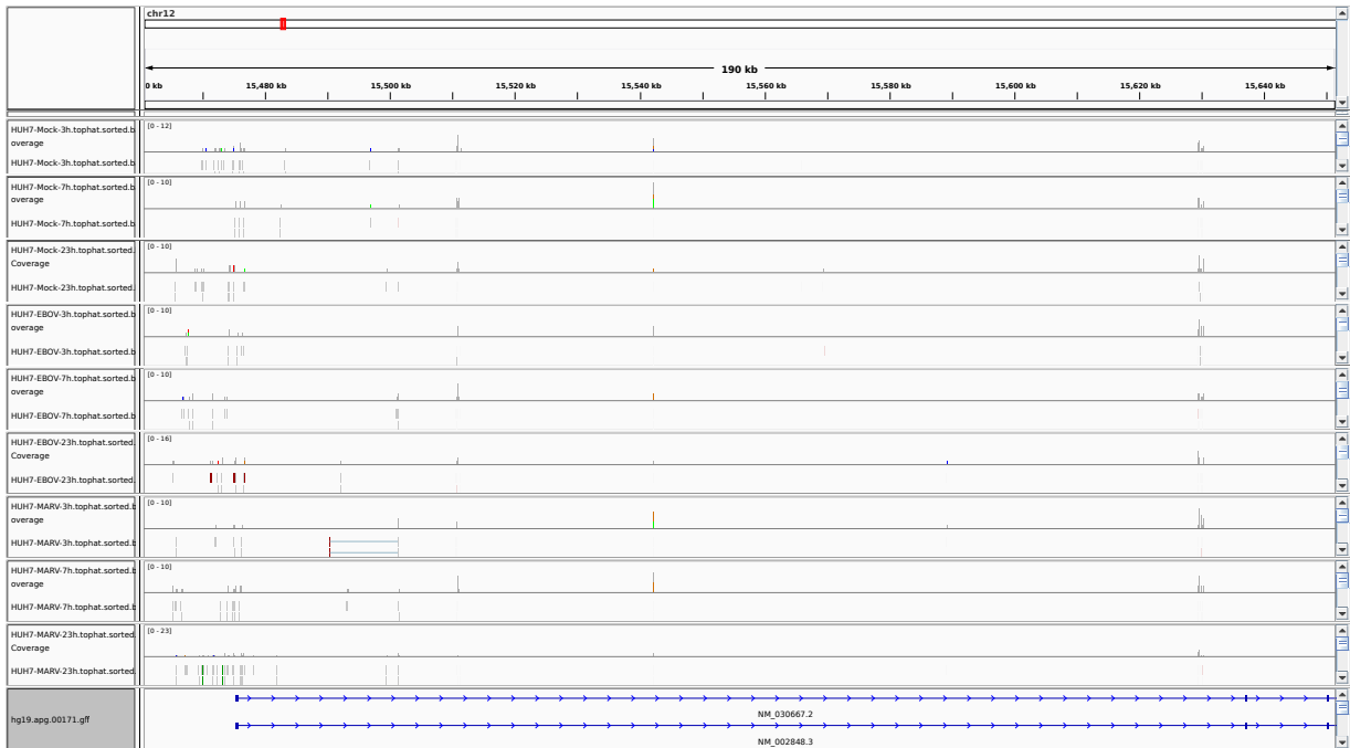
Figure 1: IGV Genome Browser screenshot of gene PTPRO.

Possesses tyrosine phosphatase activity. Very low profile, almost not transcripts.