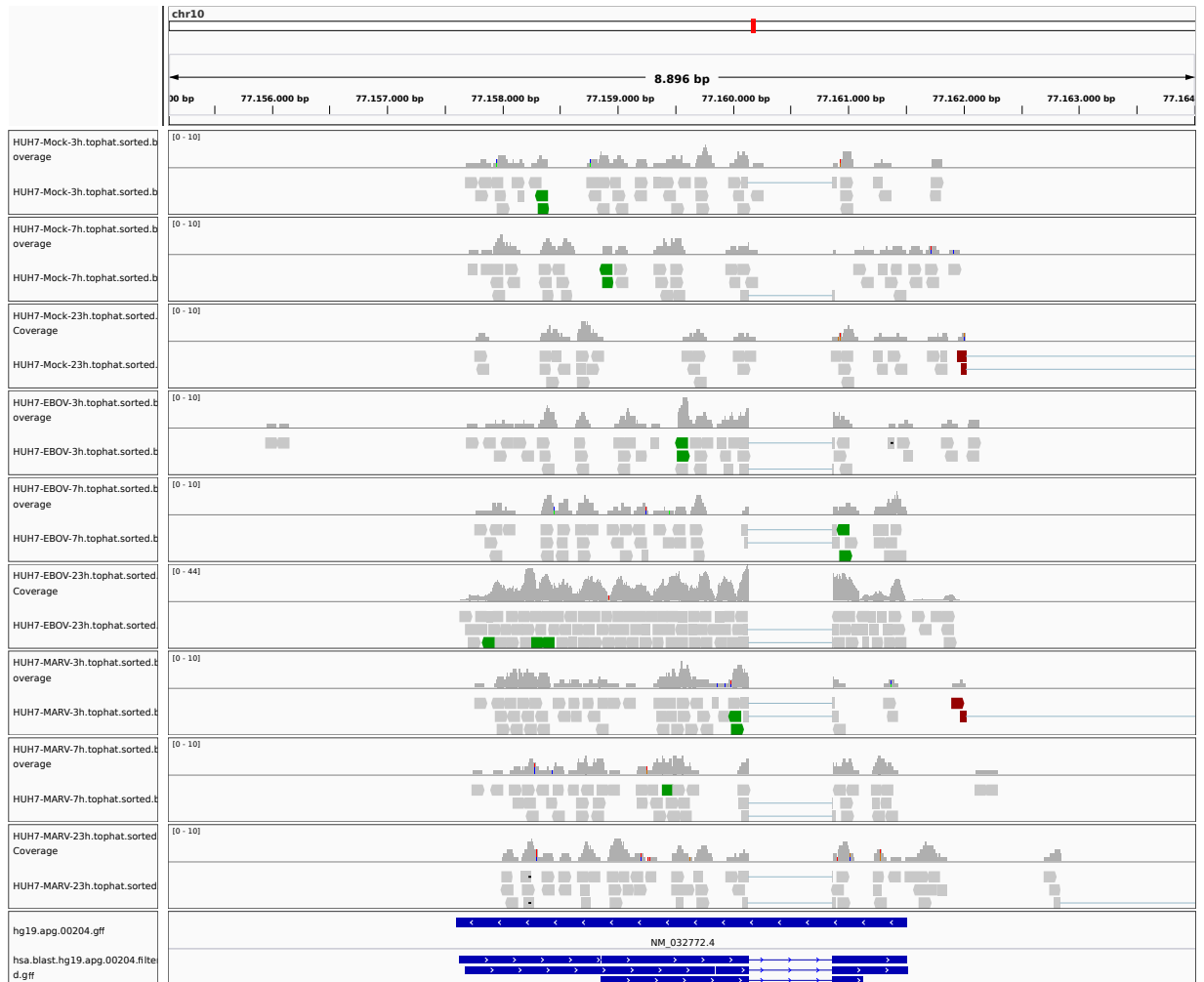
Figure 1: IGV Genome Browser screenshot of gene ZNF503.

*In human only ebola infected sample between 7h and 23h is up-regulated. In bat this gene shows complex expression patterns.*