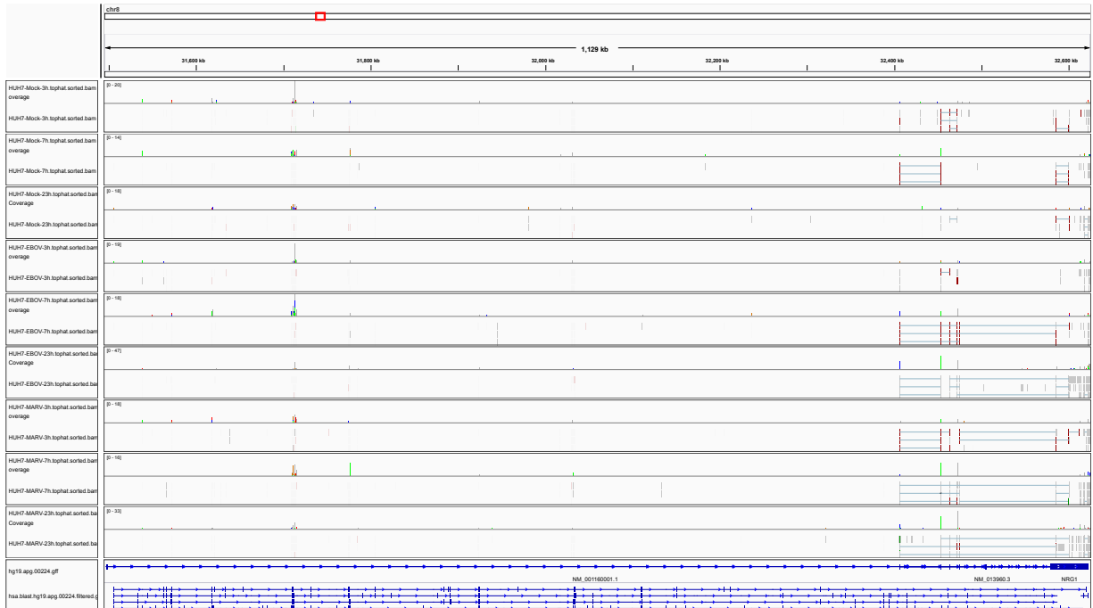
Figure 1: IGV Genome Browser screenshot of gene NRG1.