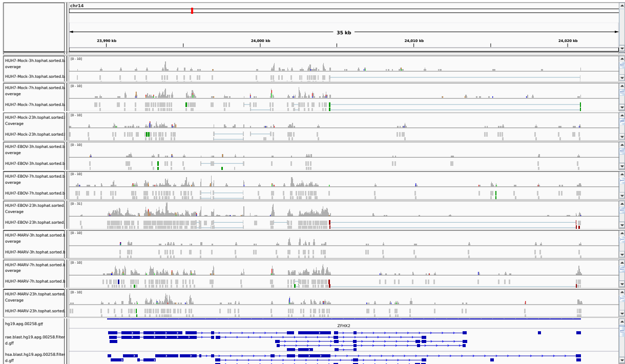
Figure 1: IGV Genome Browser screenshot of gene ZFH2.

The zinc finger homeobox 2 is involved in sequence-specific DNA binding, transcription, DNA-templated, Transcription factor. Very low expression in the samples analyzed.