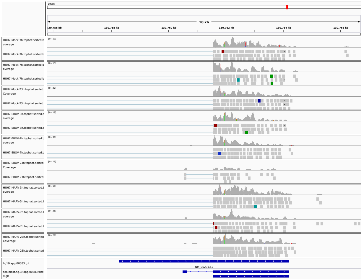
Figure 1: IGV Genome Browser screenshot of gene TMEM200A.

The protein has a minor expression, which is equal in all samples.