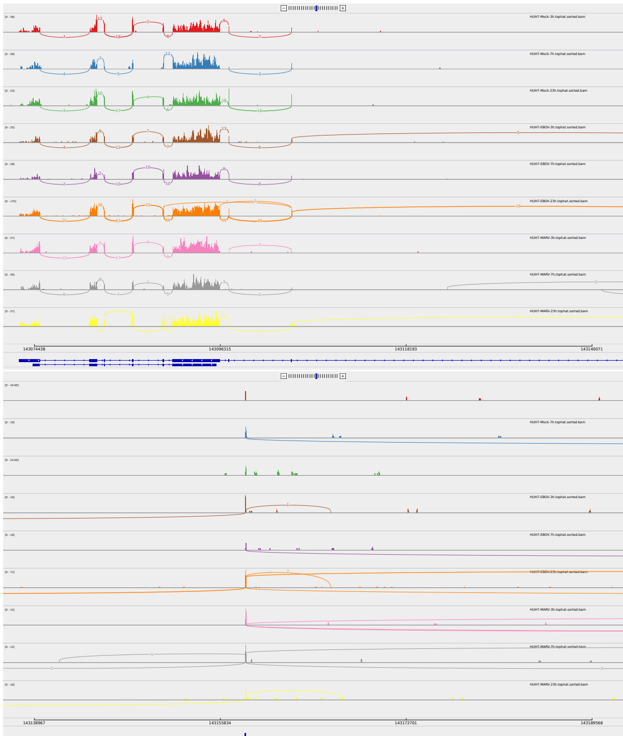
Figure 2: Sashimi plot of gene HIVEP2.