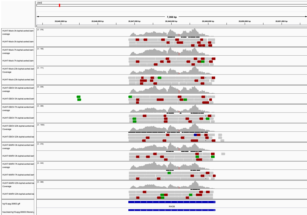
Figure 1: IGV Genome Browser screenshot of gene RHOB.

*It is upregulated upon infection of Marburg in bat, but slightly downregulated in Ebola infected bat. In human it is stably expressed, with the exception of a three times increase expression due to Ebola infection. *