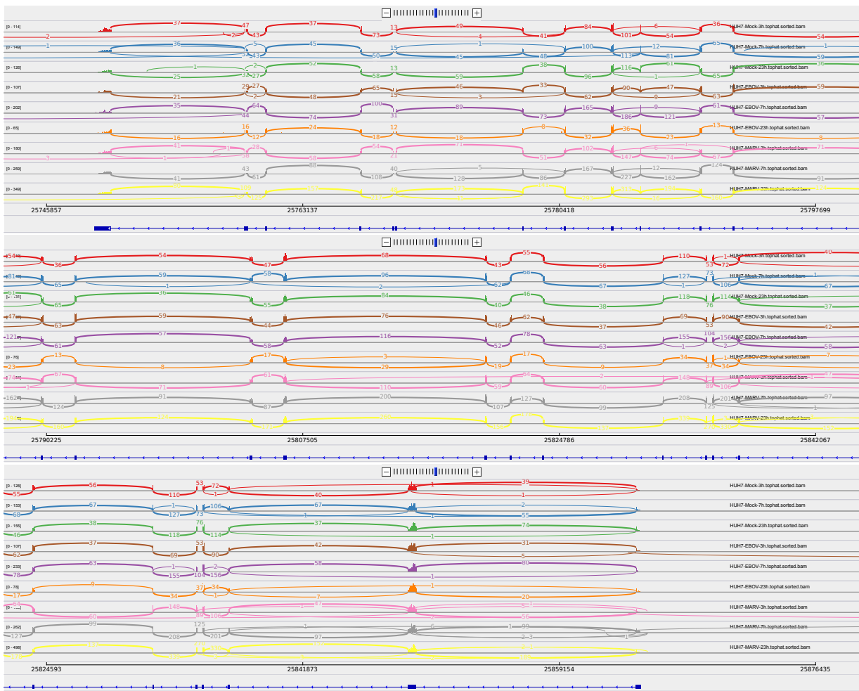
Figure 2: Sashimi plot of gene SEL1L3.