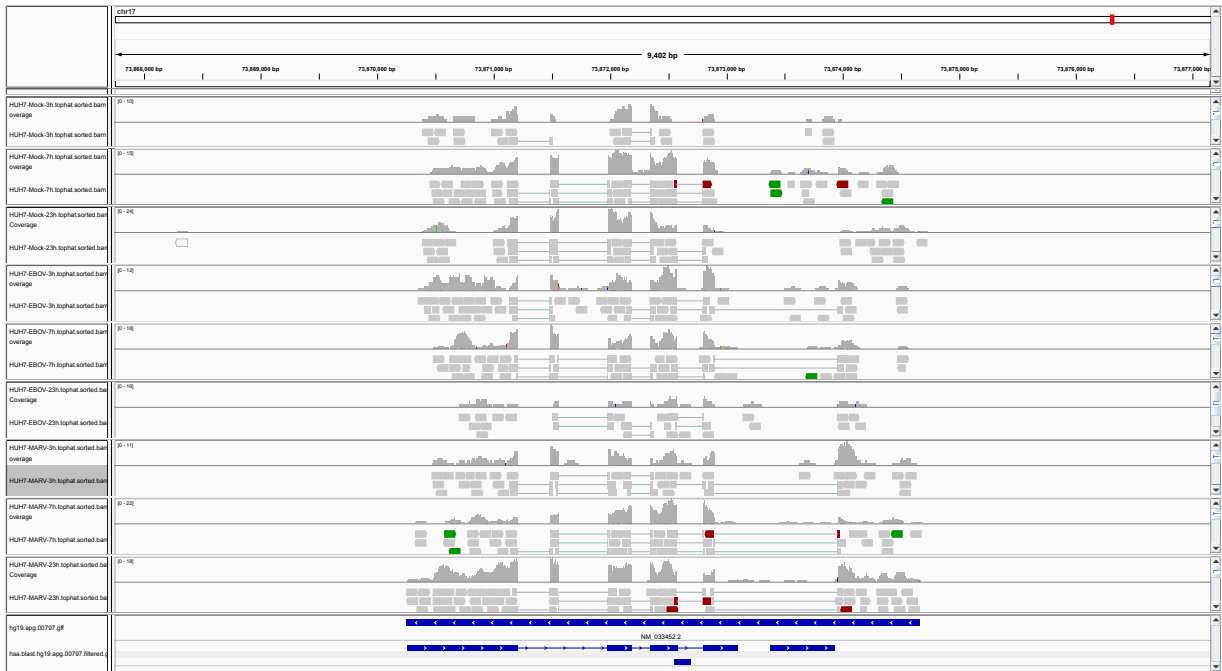
Figure 1: IGV Genome Browser screenshot of gene TRIM47.

The gene of the tripartite motif containing 47 (TRIM47) shows very low expression.