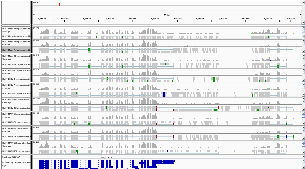
Figure 1: IGV Genome Browser screenshot of gene PER1.