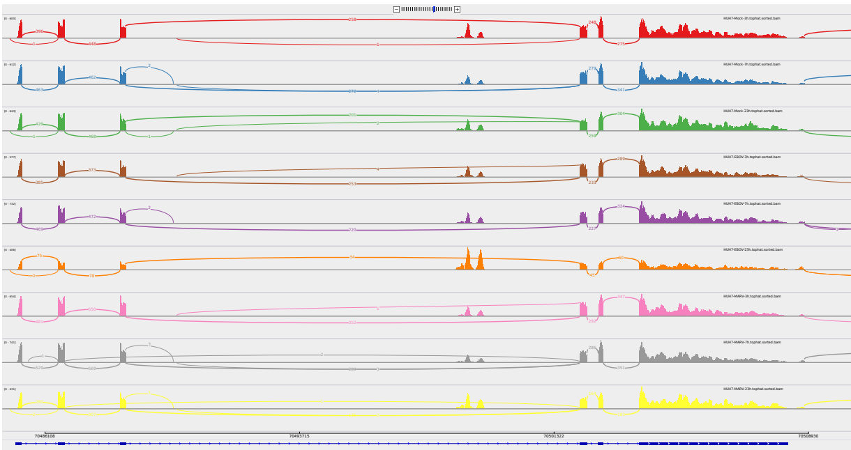
Figure 2: Sashimi plot of gene PCYOX1.