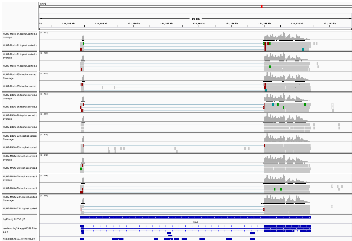
Figure 1: IGV Genome Browser screenshot of gene GJA1.

It seems to be downregulated in human infected with Ebola after 23 h and in bat.