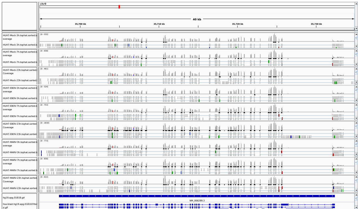
Figure 1: IGV Genome Browser screenshot of gene TLN1.

The talin 1 gene is involved in the Rap1 signaling pathway, Focal adhesion, Platelet activation and HTLV-I infection. It seems to be slightly upregulated during ebola infection in human.