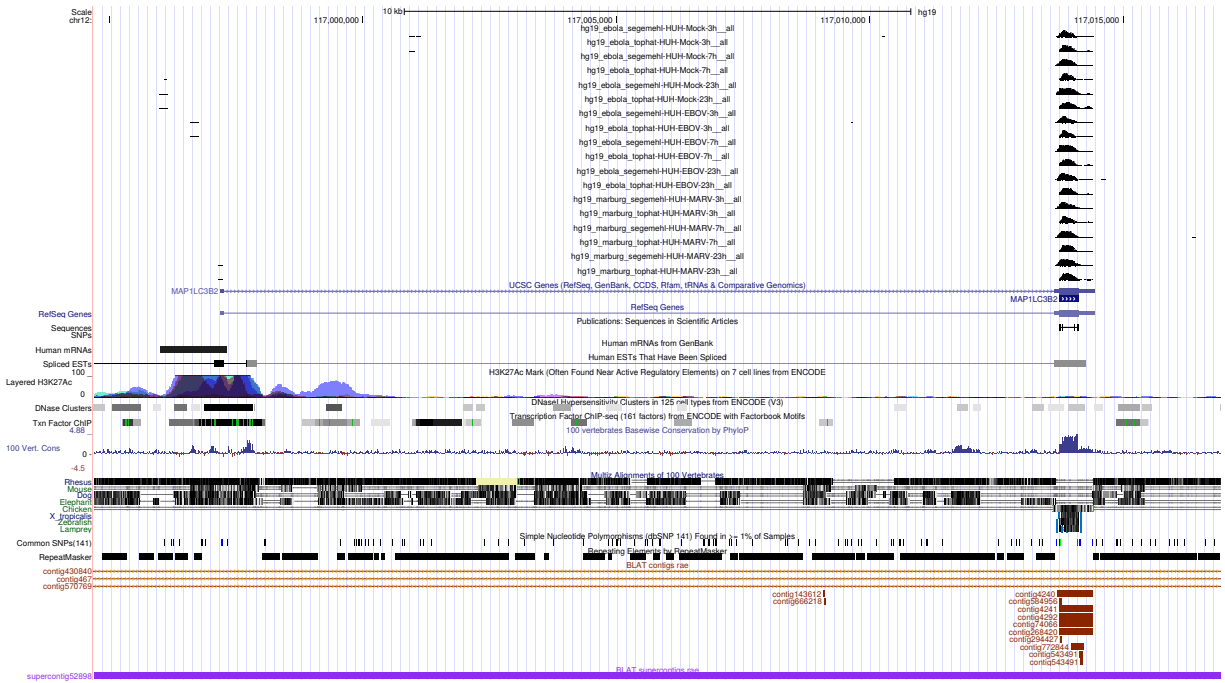
Figure 3: UCSC Genome Browser screenshot of gene MAP1LC3B2.