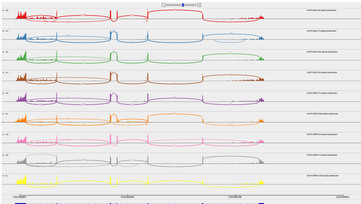
Figure 2: Sashimi plot of gene LRP11.