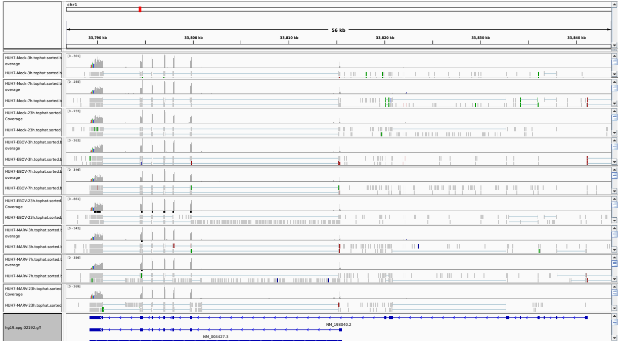
Figure 1: IGV Genome Browser screenshot of gene PHC2.