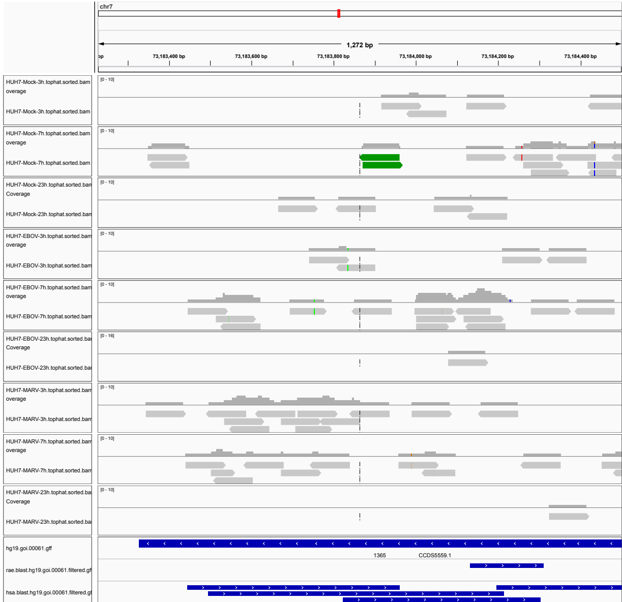
Figure 1: IGV Genome Browser screenshot of gene CLDN3.

Some differences but low expression level.