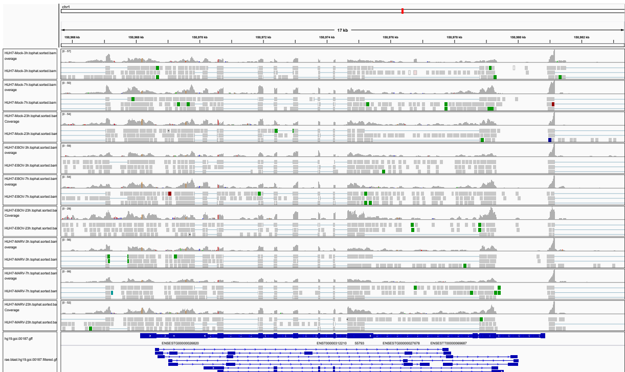
Figure 1: IGV Genome Browser screenshot of gene FAM63A.

Low expression in human and no homolog found in bat.