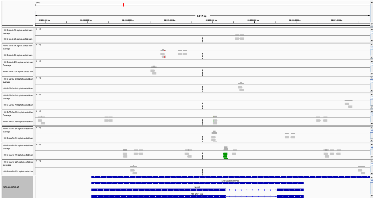
Figure 1: IGV Genome Browser screenshot of gene TLR9.

Equally expressed under all investigated conditions in human and bat.