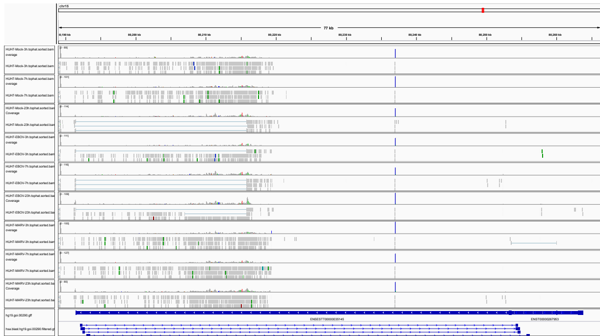
Figure 1: IGV Genome Browser screenshot of gene BCL2A1.

This gene was found to be not expressed in all of our human probes but a very low expression level in bat.