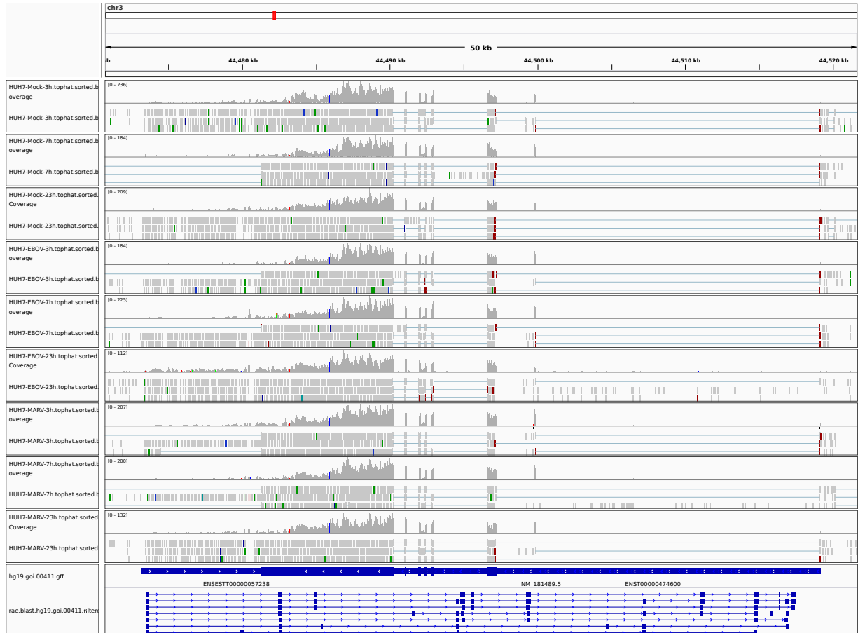
Figure 1: IGV Genome Browser screenshot of gene ZNF445.

*The gene is downregulated to half the level 23h after infection with Ebola virus in human and only slightly downregulated in bat 23h after infection.*