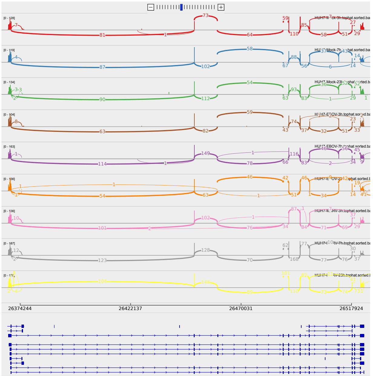
Figure 2: Sashimi plot of gene NLK.