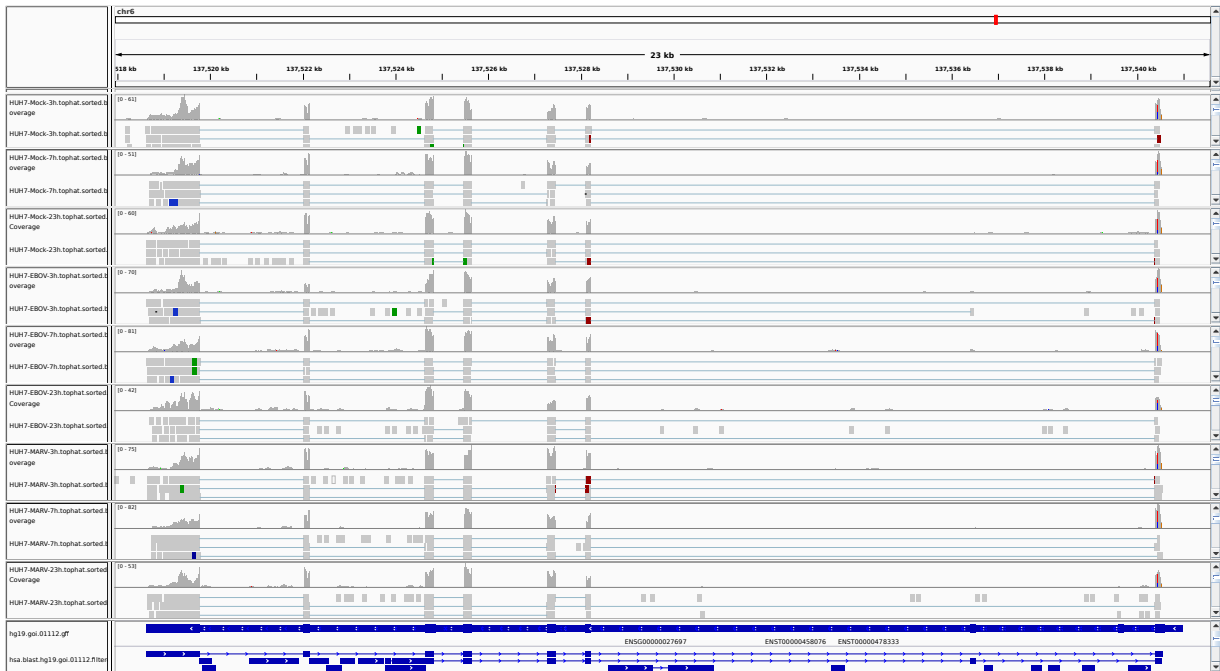
Figure 1: IGV Genome Browser screenshot of gene IFNGR1.

This gene is weakly expressed in human cells and expressed in normal levels in bat cells.