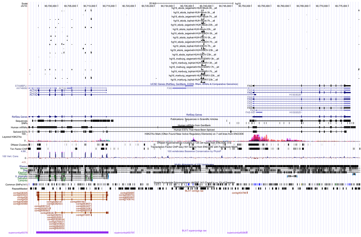
Figure 2: UCSC Genome Browser screenshot of gene FAS.