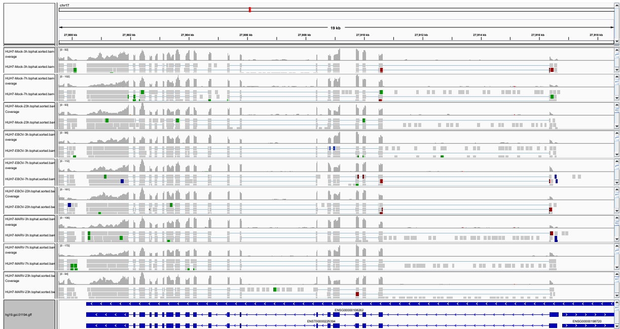
Figure 1: IGV Genome Browser screenshot of gene GIT1.

This gene is slightly upregulated in bat after Ebola an Marburg infection.