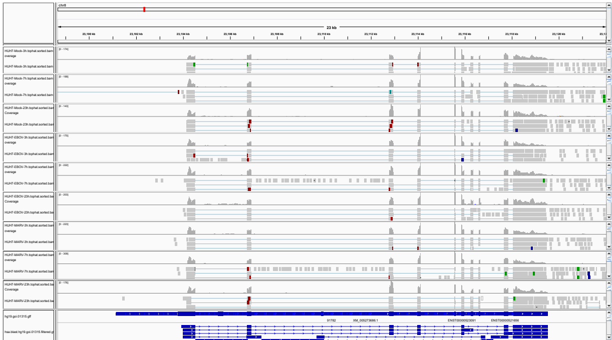
Figure 1: IGV Genome Browser screenshot of gene CHMP7.

Homo sapiens charged multivesicular body protein 7 (CHMP7), mRNA. Expressed in all samples, some variation in expression level.