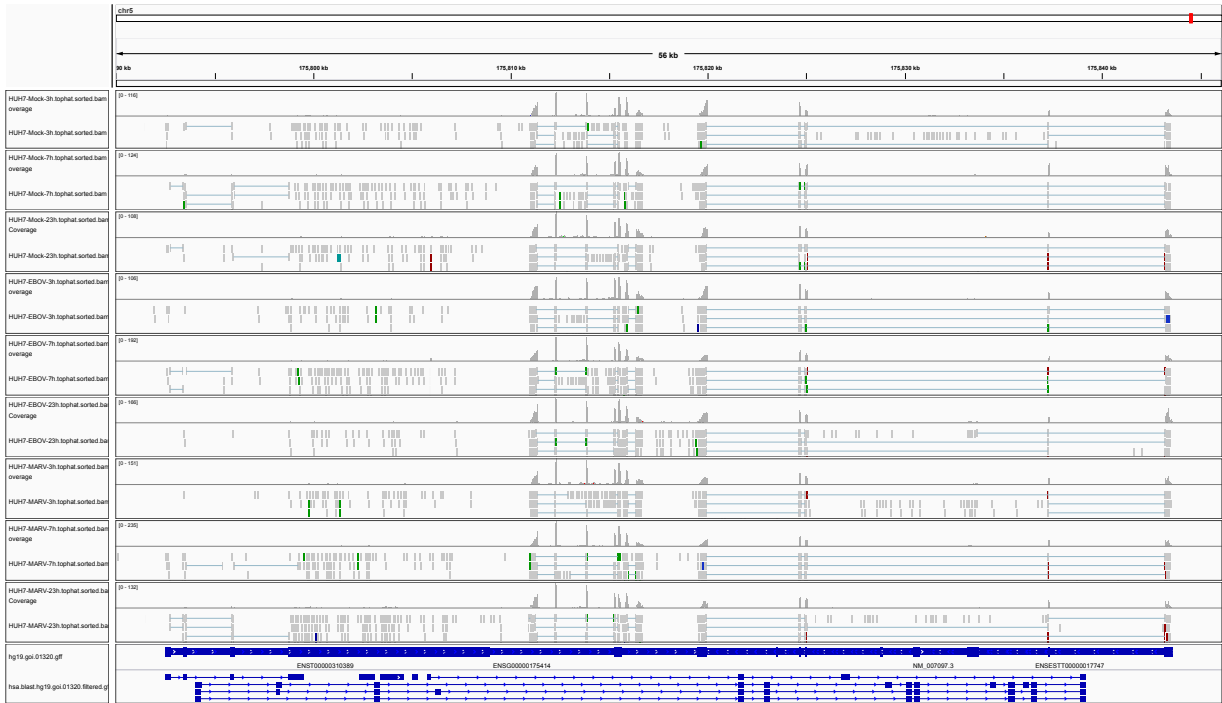
Figure 1: IGV Genome Browser screenshot of gene CLTB.

Homo sapiens ADP-ribosylation factor-like 10 (ARL10), mRNA. Expressed in all samples, some variation in expression level.