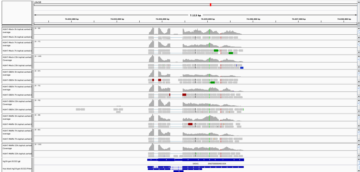
Figure 1: IGV Genome Browser screenshot of gene DDIT4.

Homo sapiens DNA-damage-inducible transcript 4. The human transcript is upregulated in later time points in mock infected and Marburg virus infected data but not in Ebola.