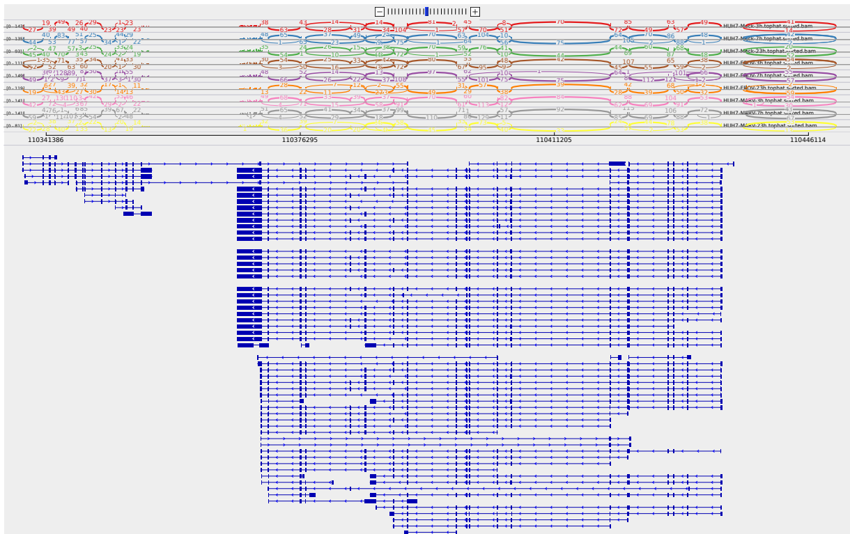
Figure 2: Sashimi plot of gene GIT2.