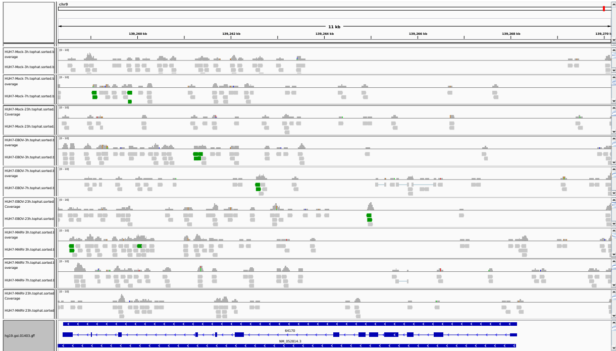
Figure 1: IGV Genome Browser screenshot of gene CARD9.

The protein encoded by this gene is a member of the CARD protein family, which is defined by the presence of a characteristic caspase-associated recruitment domain (CARD). CARD is a protein interaction domain known to participate in activation or suppression of CARD containing members of the caspase family, and thus plays an important regulatory role in cell apoptosis. This protein was identified by its selective association with the CARD domain of BCL10, a positive regulator of apoptosis and NF-kappaB activation, and is thought to function as a molecular scaffold for the assembly of a BCL10 signaling complex that activates NF-kappaB. Several alternatively spliced transcript variants have been observed, but their full-length nature is not clearly defined. It is not expressed in human but very weak expression can be observed in bat.