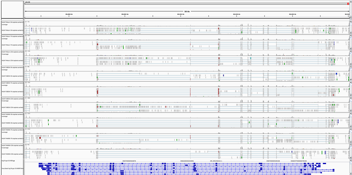
Figure 1: IGV Genome Browser screenshot of gene SPIRE2.

The gene SPIRE2 is weakly expressed in human and bat datasets. SPIRE2 (spire-type actin nucleation factor 2) is a protein-coding gene. GO annotations related to this gene include actin binding. An important paralog of this gene is SPIRE1.