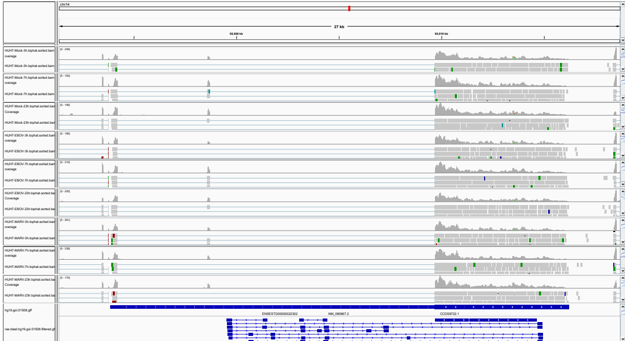
Figure 1: IGV Genome Browser screenshot of gene SOCS4.

There were no significant expression changes within these well-expressed gene.